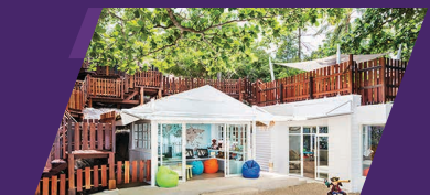
StarKid Kids Club Daily Program of Activities 9:00 AM - 6:00 PM

Facial Wash Powder Facial Massage Cream Facial Mask Facial Moisturizing Cream THB 1,200++ per person