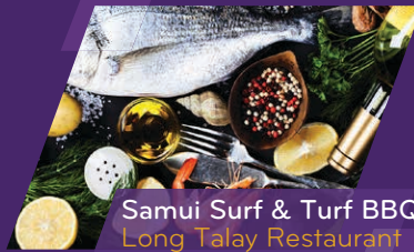
Samui Surf & Turf BBQ Long Talay Restaurant Saturday 6:00 PM - 10:00 PM

Allow us to cook your favorite fish and seafood to perfection at our Seafood Market every Thursday night right on the beachfront. Enjoy relaxing live music as you taste the freshest catch of the day and sip a tropical cocktail. All prices selling by weight