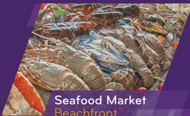
Seafood Market Beachfront Thursday 6:00 PM - 10:00 PM

FOR RESERVATIONS, PLEASE PRESS [0] OR CONTACT ANY OF OUR RESORT ASSOCIATES