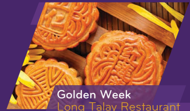
Golden Week Long Talay Restaurant Sat 30 Sept - Sat 7 Oct 6:00 PM - 10:00 PM

Maximize your tropical island experience at our Surf & Turf BBQ this Saturday evening. Taste freshly grilled premium meats and seafood. THB 1,200++ per adult THB 600++ per child (4-11yrs)